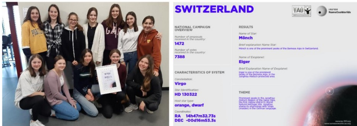
Class L3a Cantonal School Menzingen, the winners of the naming Mönch and Eiger

As was announced in the last newsletter of December 2019, Eiger and Mönch are now immortalized in the constellation Jungfrau at the firmament. In the meantime, the certificates of the IAU have arrived.